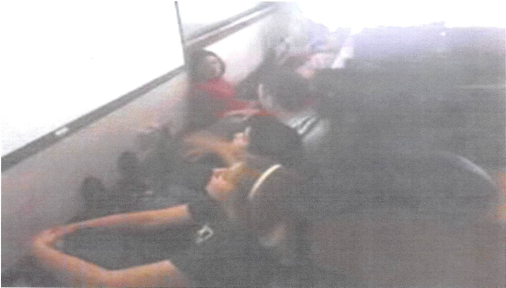
Students take cover in French class in Holden Hall at Virginia Tech (next to Norris Hall)